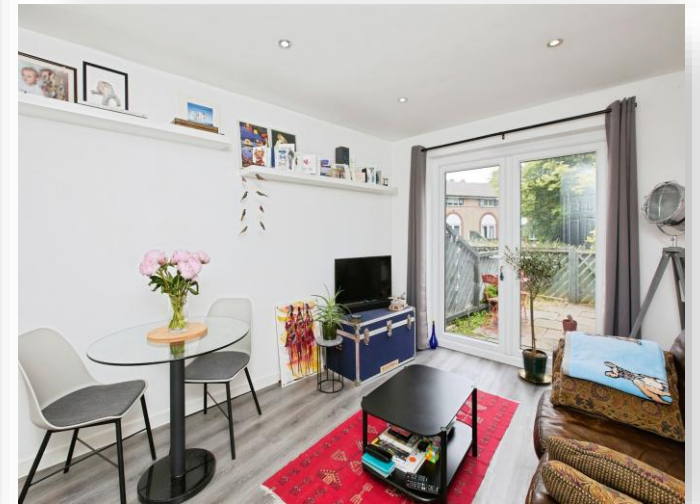
Wellington Crescent, Derby DE1 2LZ