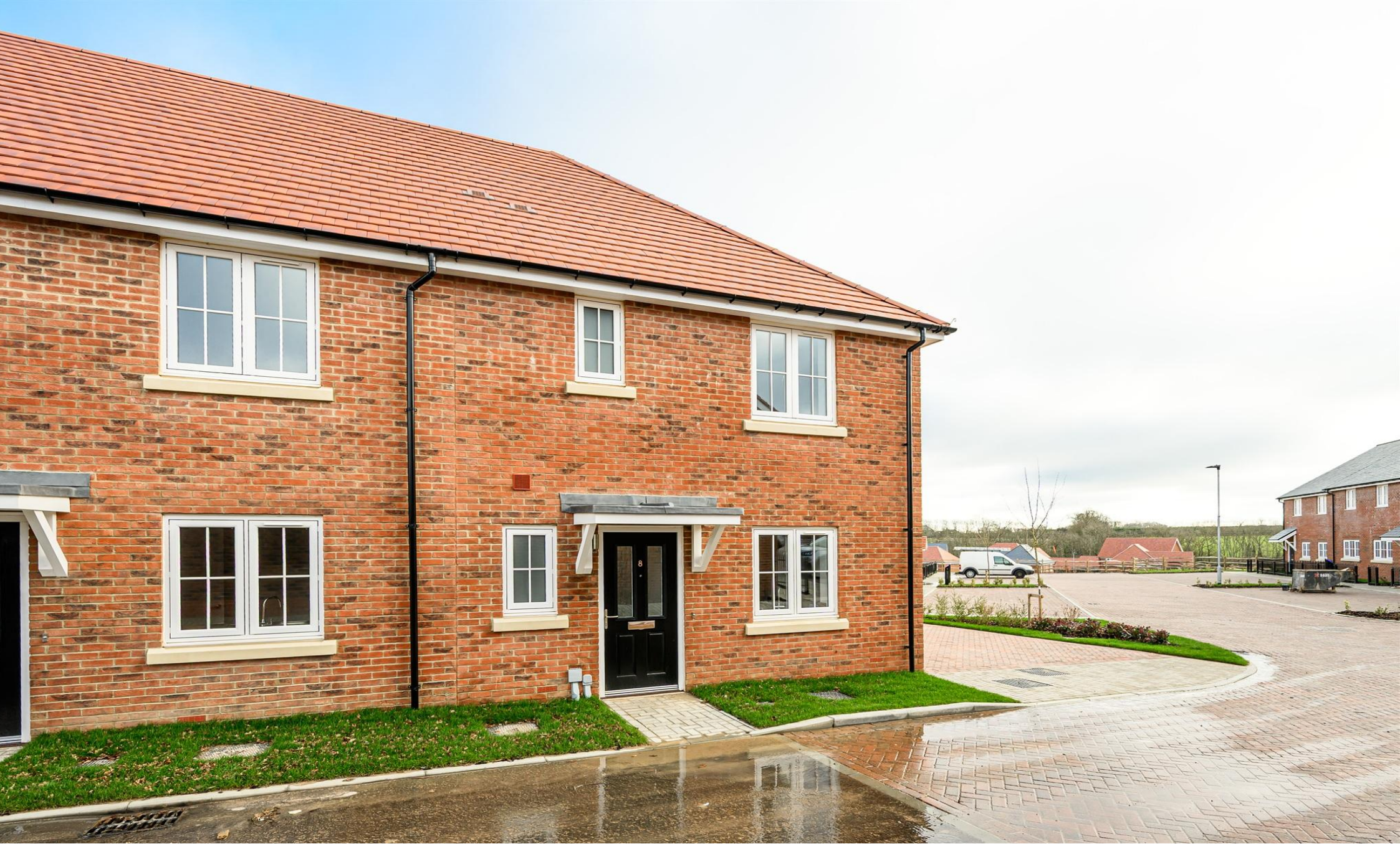
Plot 131 Hartley Acres, Cranbrook TN17 3FE