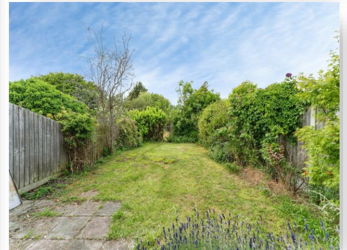
Norwood Road, March PE15 8JN