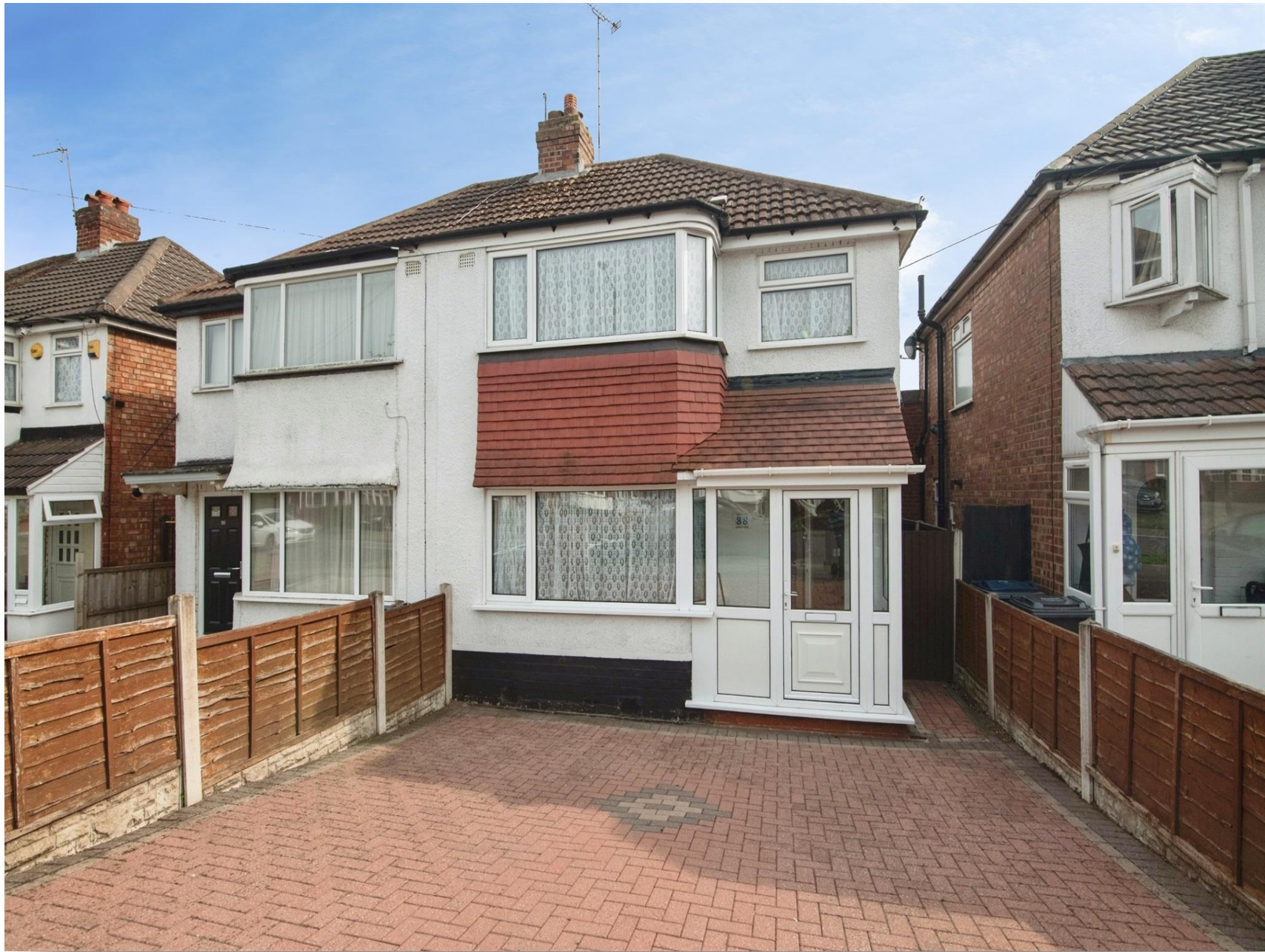
Rocky Lane, Perry Barr Birmingham B42 1QF