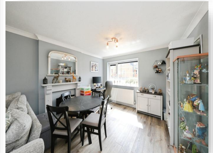
Broom Close, Wath-upon-Dearne ROTHERHAM S63 7JU