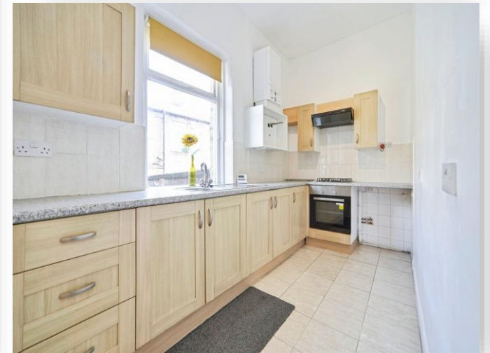
Constance Street,Saltaire Shipley BD18 4LX