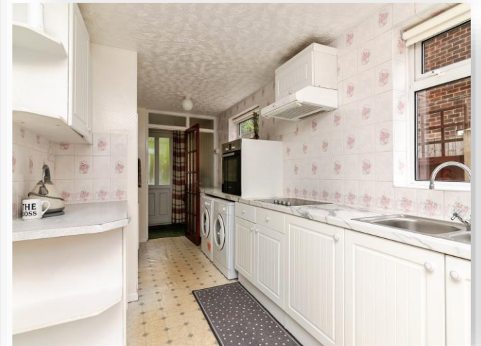
Glapton Lane, Nottingham NG11 8DE