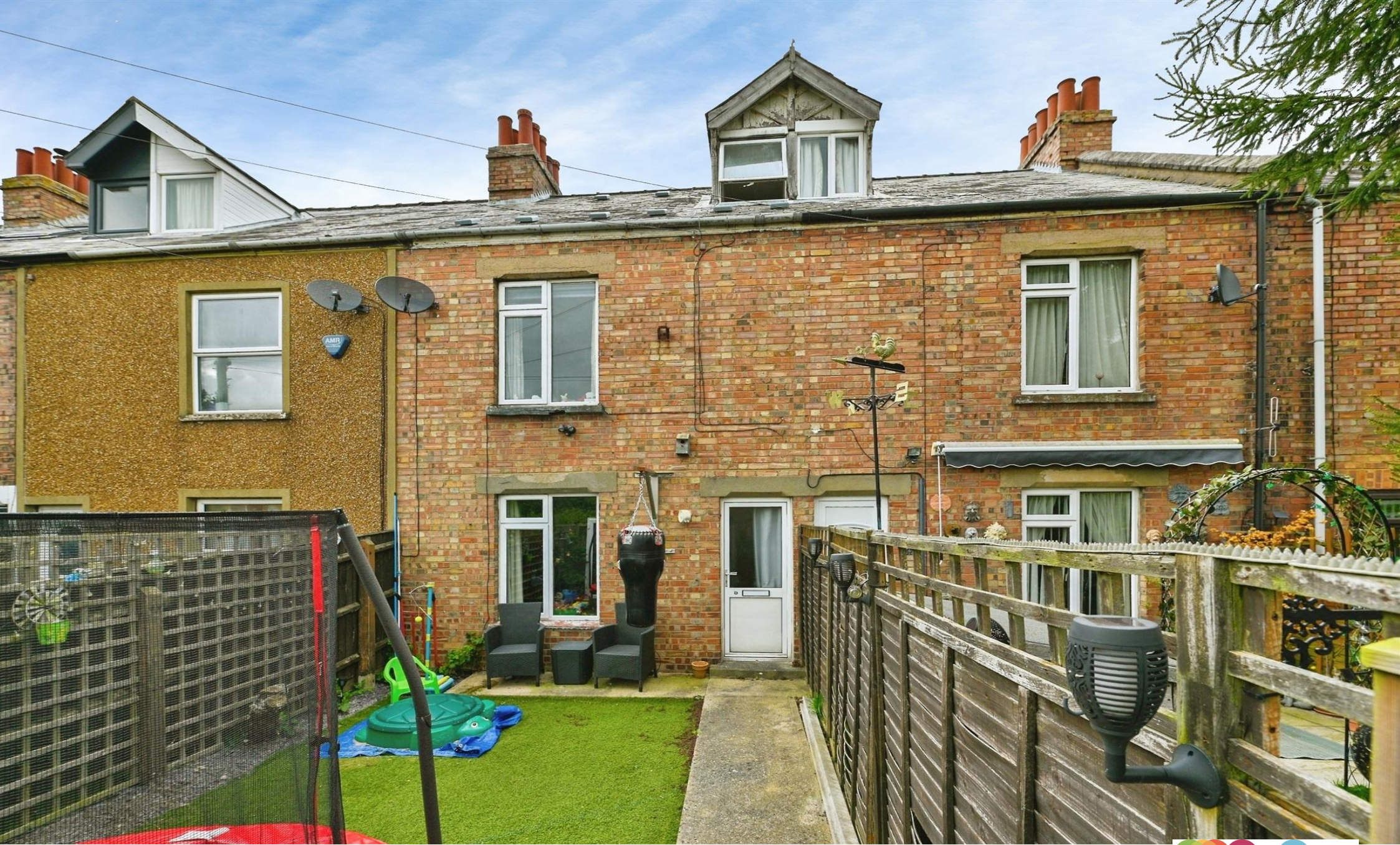
Manor Terrace, Terrington St. Clement, KING'S LYNN, PE34 4NF