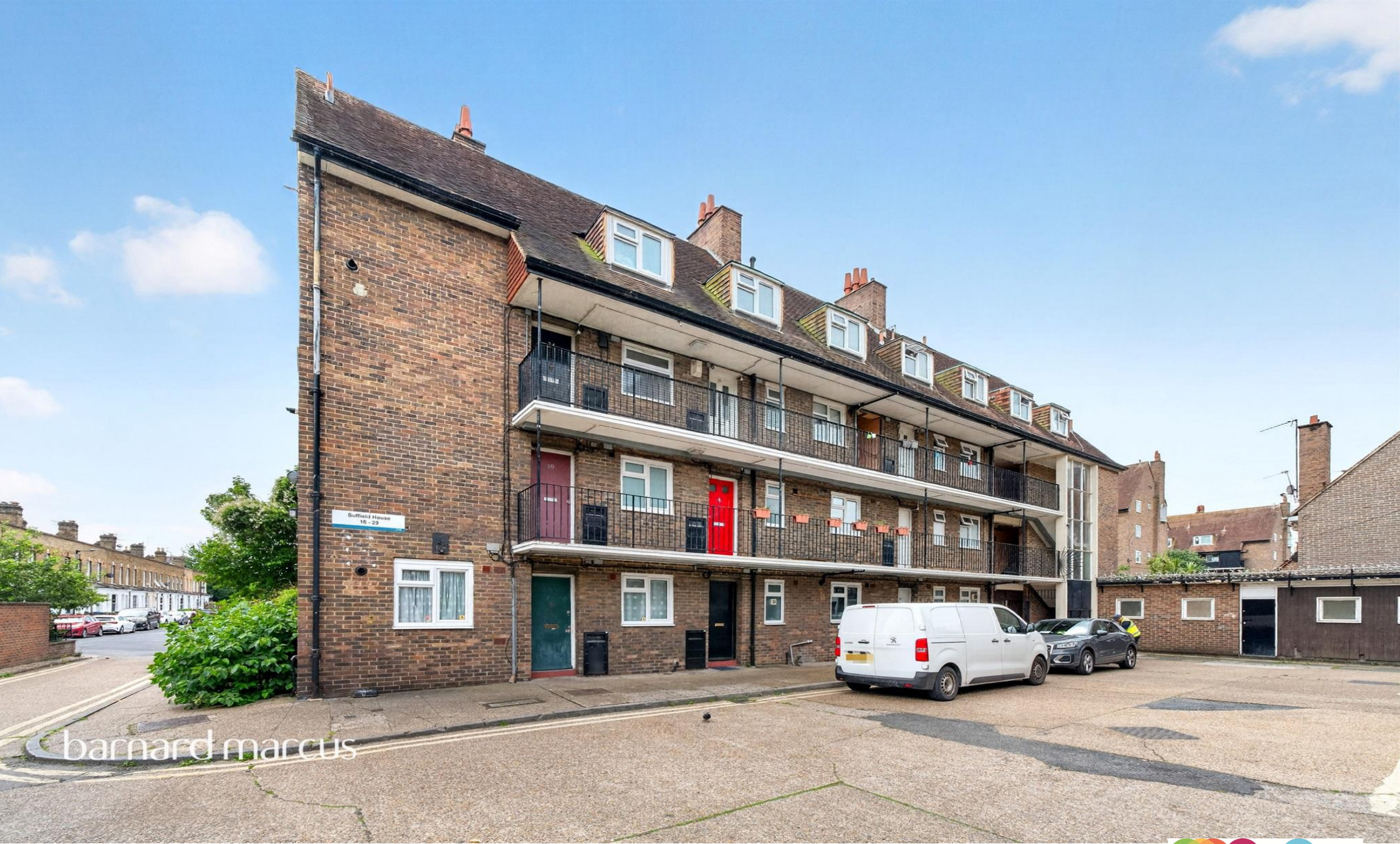
Suffield House Alberta Estate, London SE17