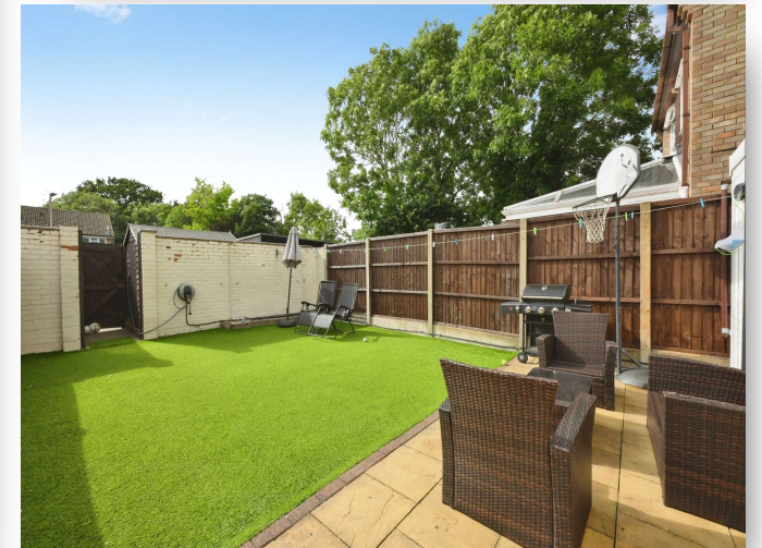
Perrysfield Road, Cheshunt Waltham Cross EN8 0TE