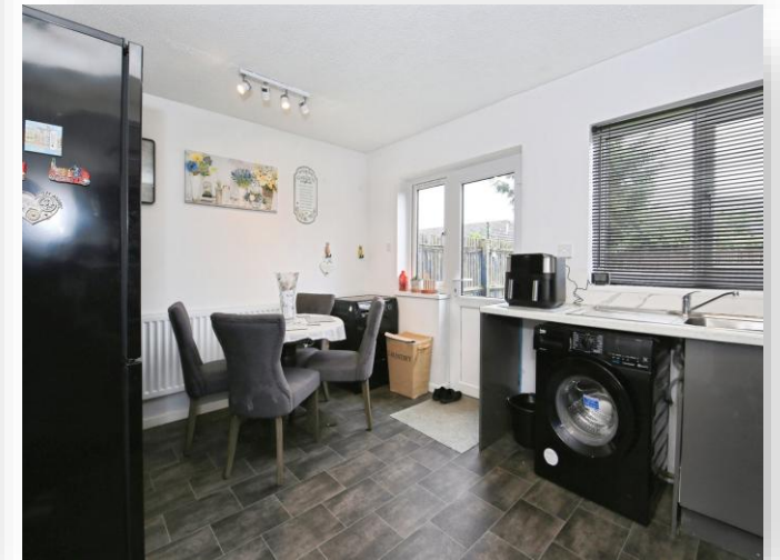
Monks Close, Whittlesey Peterborough PE7 1PS