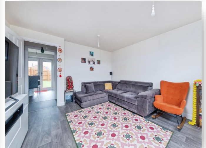
Alfred Way, Buckingham MK18 1WP