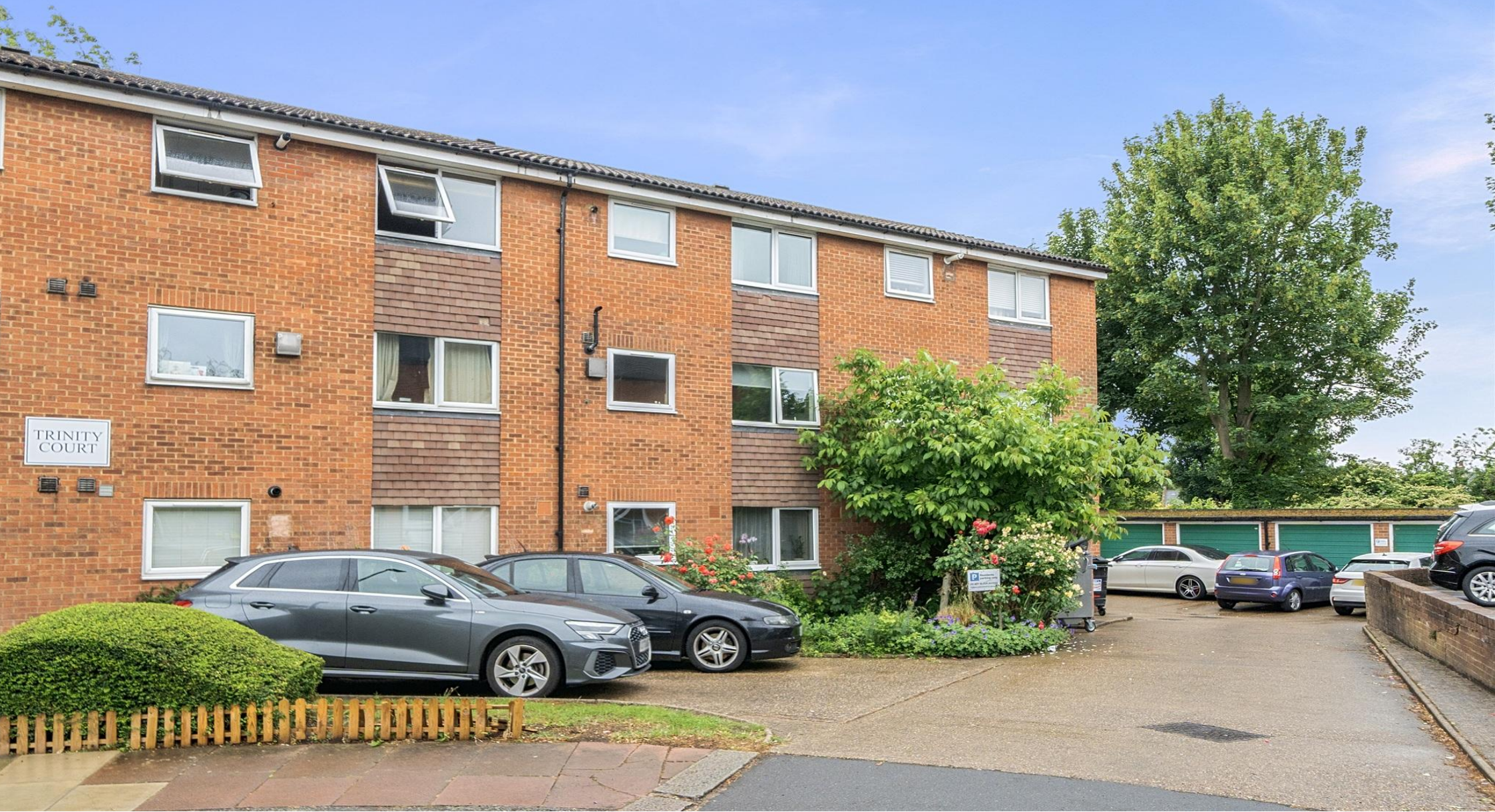
Trinity Court, Queens Avenue, Winchmore Hill, N21 3JF