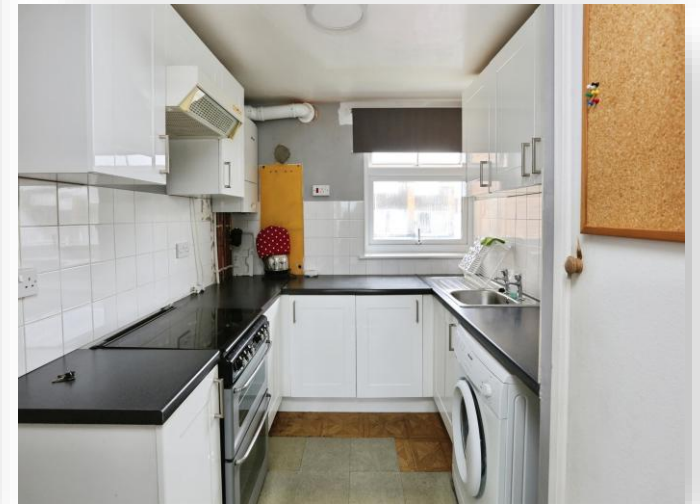
Wickham Court, Gale Moor Avenue, Gosport, PO12 2TF