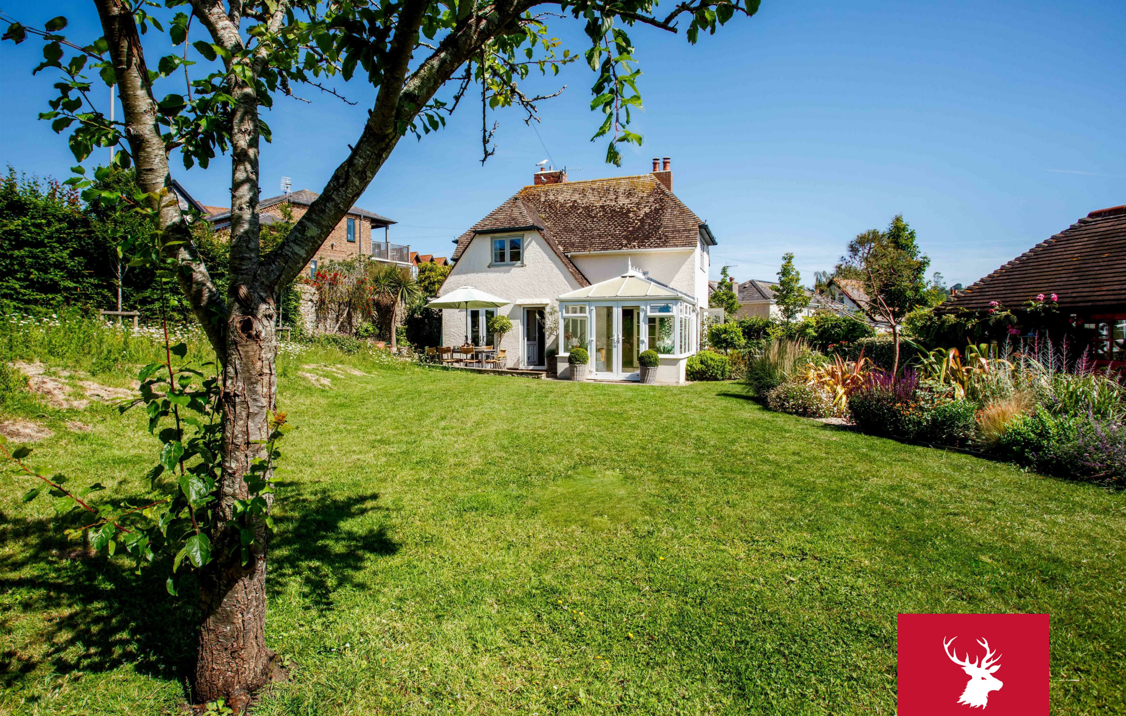
Hernelee Cottage Pound Road