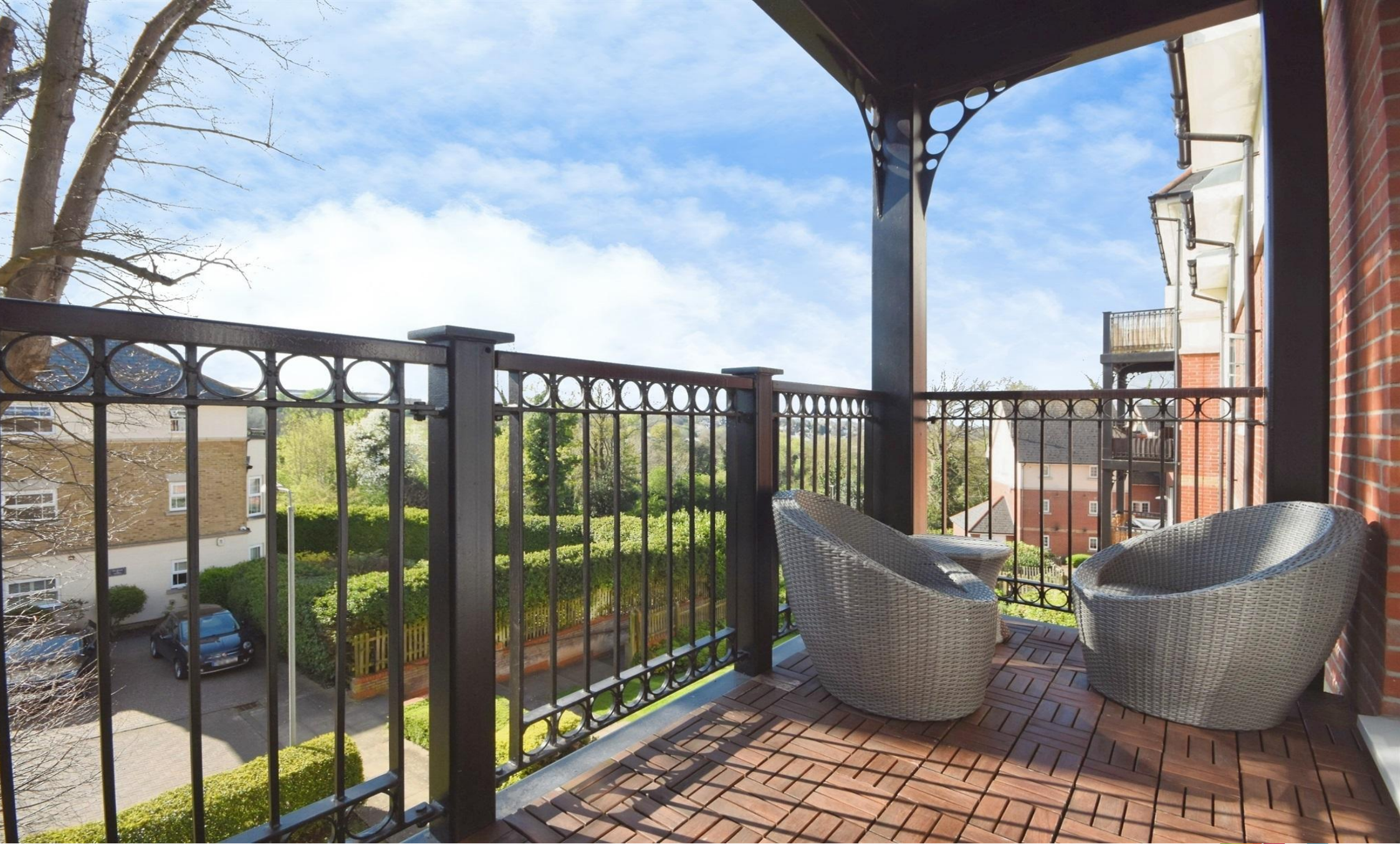
Edmund Rice House, Milan Walk, Brentwood, CM14 4JP