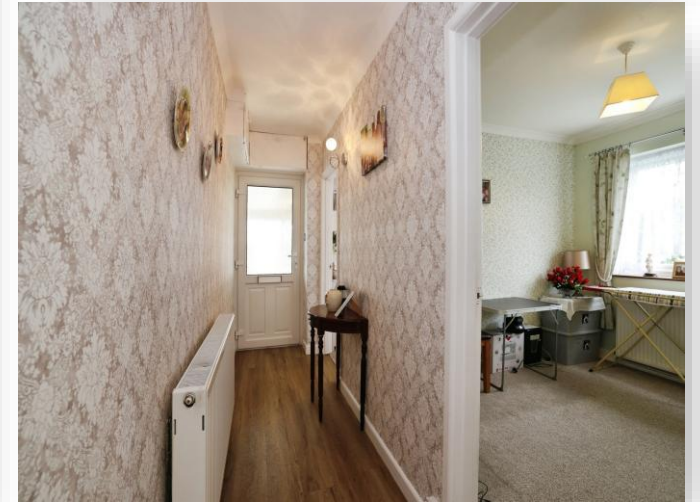
47 Kitchener Road, Amesbury Salisbury SP4 7AA