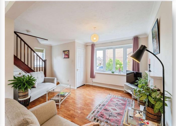
Spencer Way, Stowmarket, IP14 1UQ