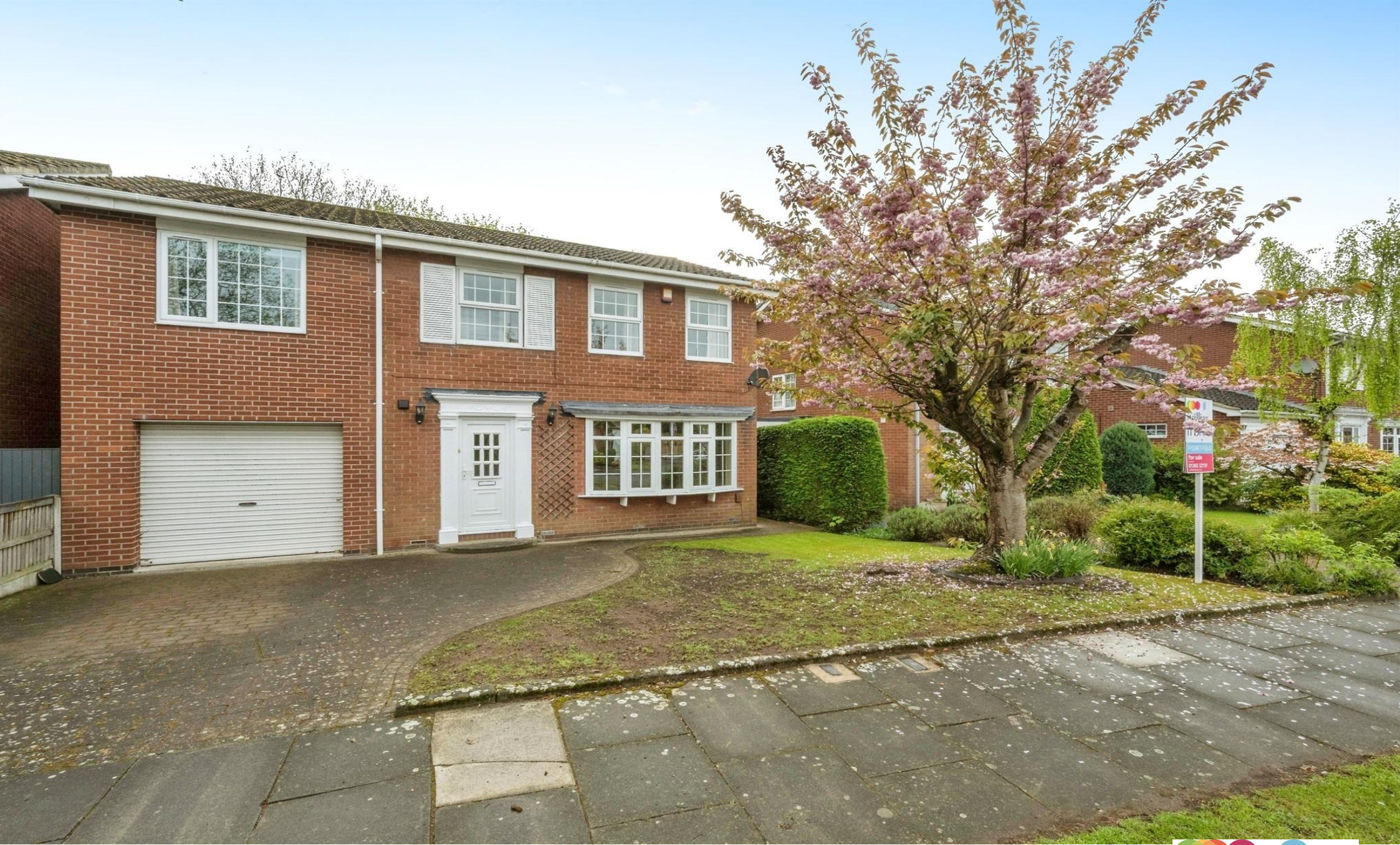
Saundby Close, Bessacarr Doncaster