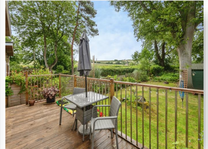
Cleeve Park, Chapel Cleeve, Minehead, TA24 6JF