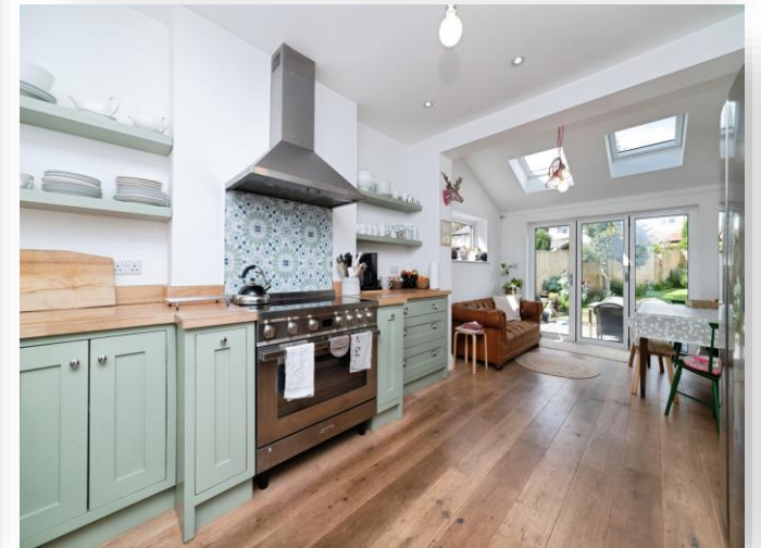
Barrow Lane, Hessle HU13 0QB