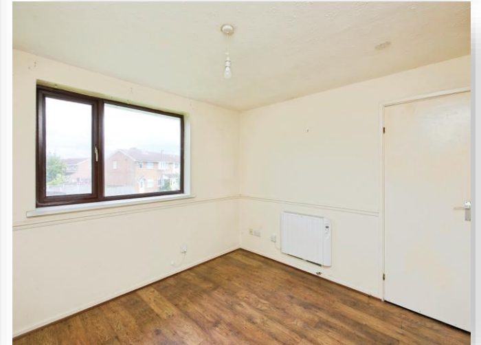
Kestrels Croft, Sinfin Derby DE24 3EW