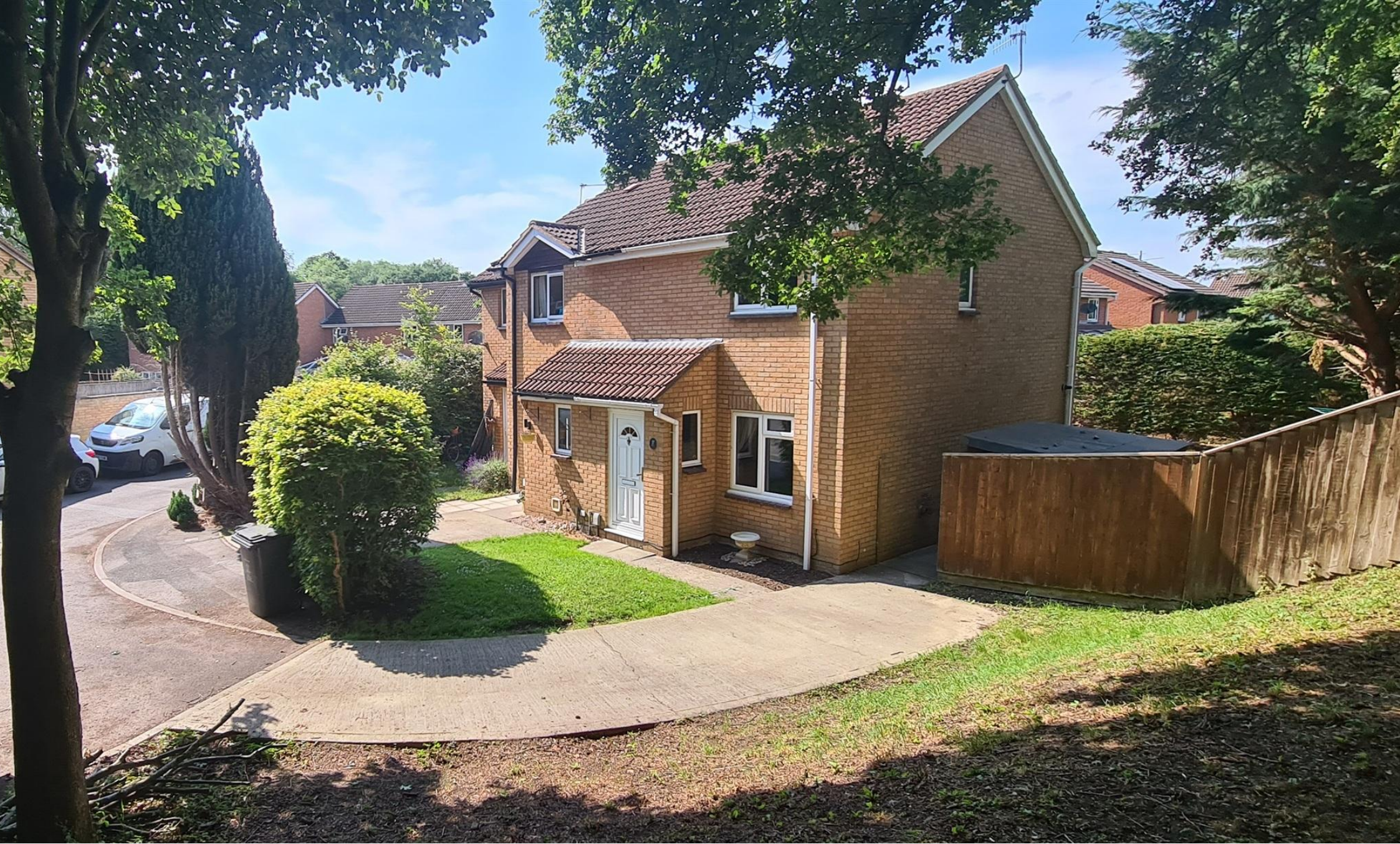
Partridge Close, Swindon SN3 5EU