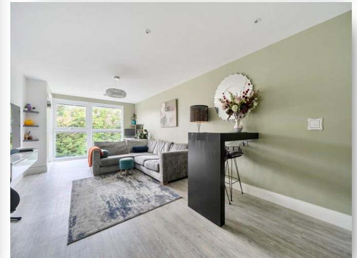
Apartment 22 Exclusive House, Oldfield Road, Maidenhead SL6 1NQ