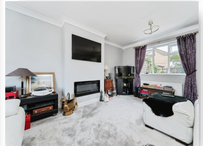
Bittern Way, MARCH PE15 9HX