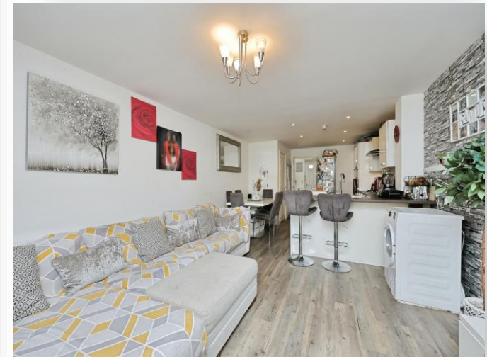
Falcon Crescent, Costessey, Norwich, NR8 5GW