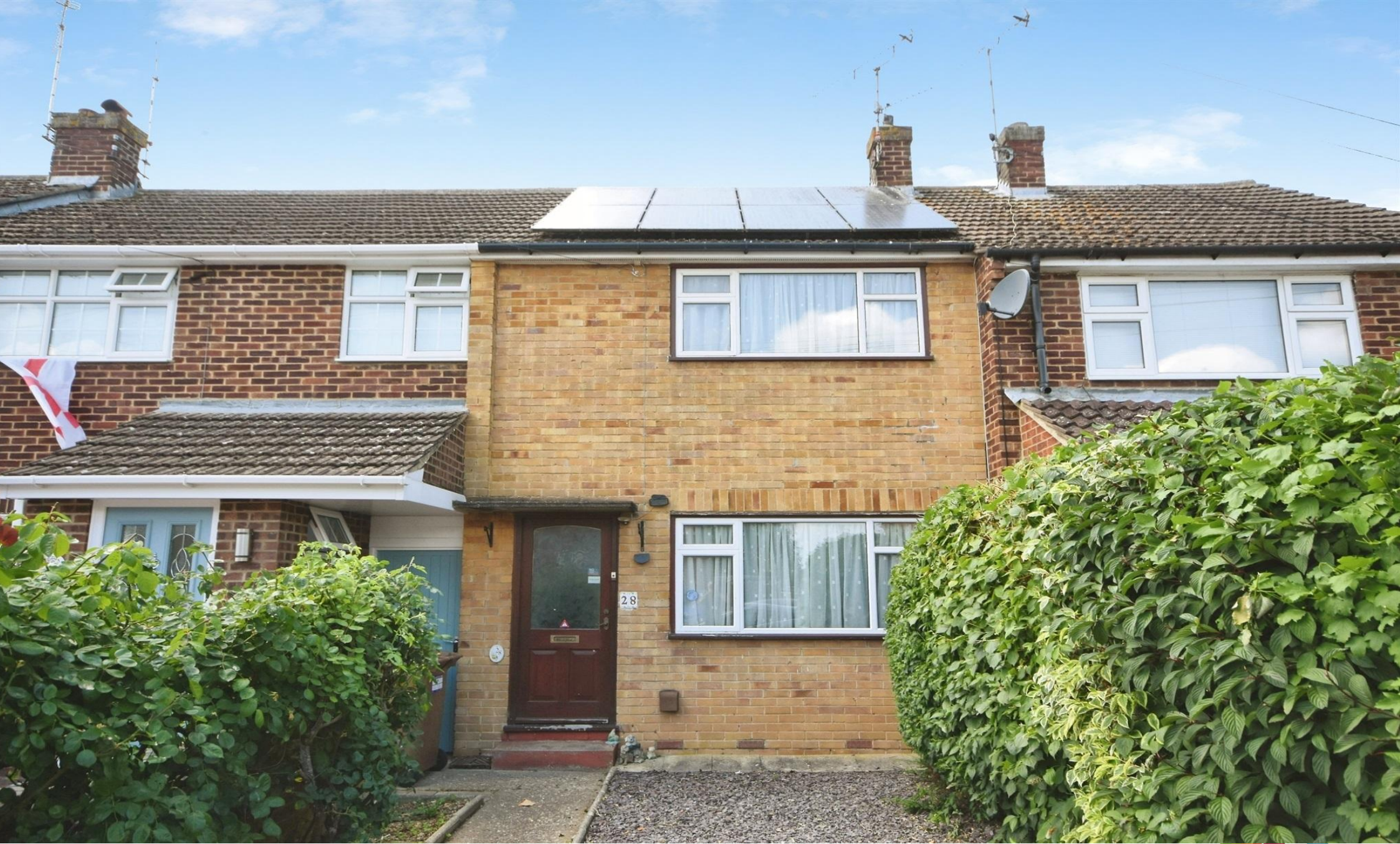
Ash Grove, Moulsham Lodge Chelmsford CM2 9JT