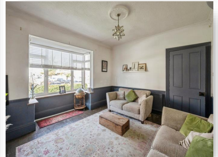
Chapel Street, Wath-Upon-Dearne Rotherham S63 7RL