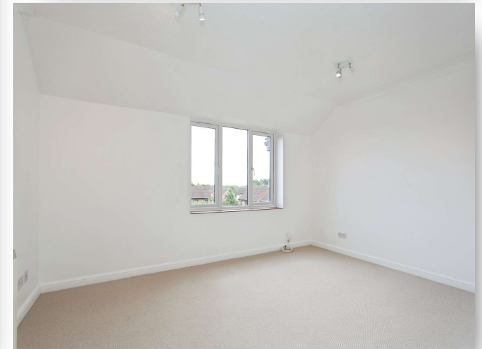
141 The Sycamores, Milton, Cambridge, CB24 6ZH