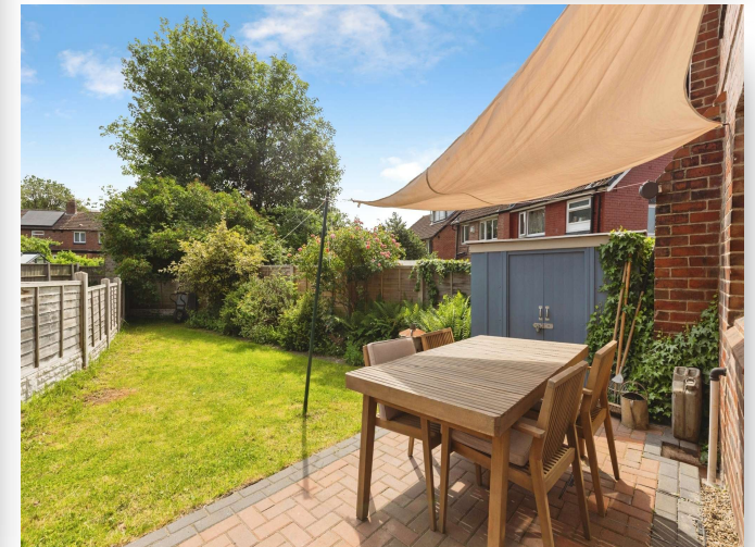
Burley Wood Lane, Leeds LS4 2SU