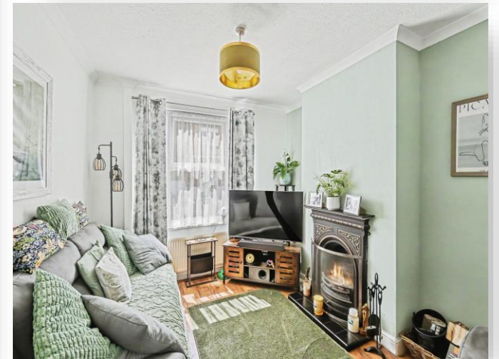
Baker Street, Northampton NN2 6DJ