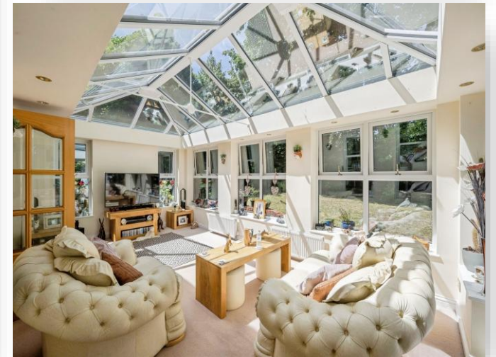
Racecourse Close, Swinton Mexborough S64 8EW