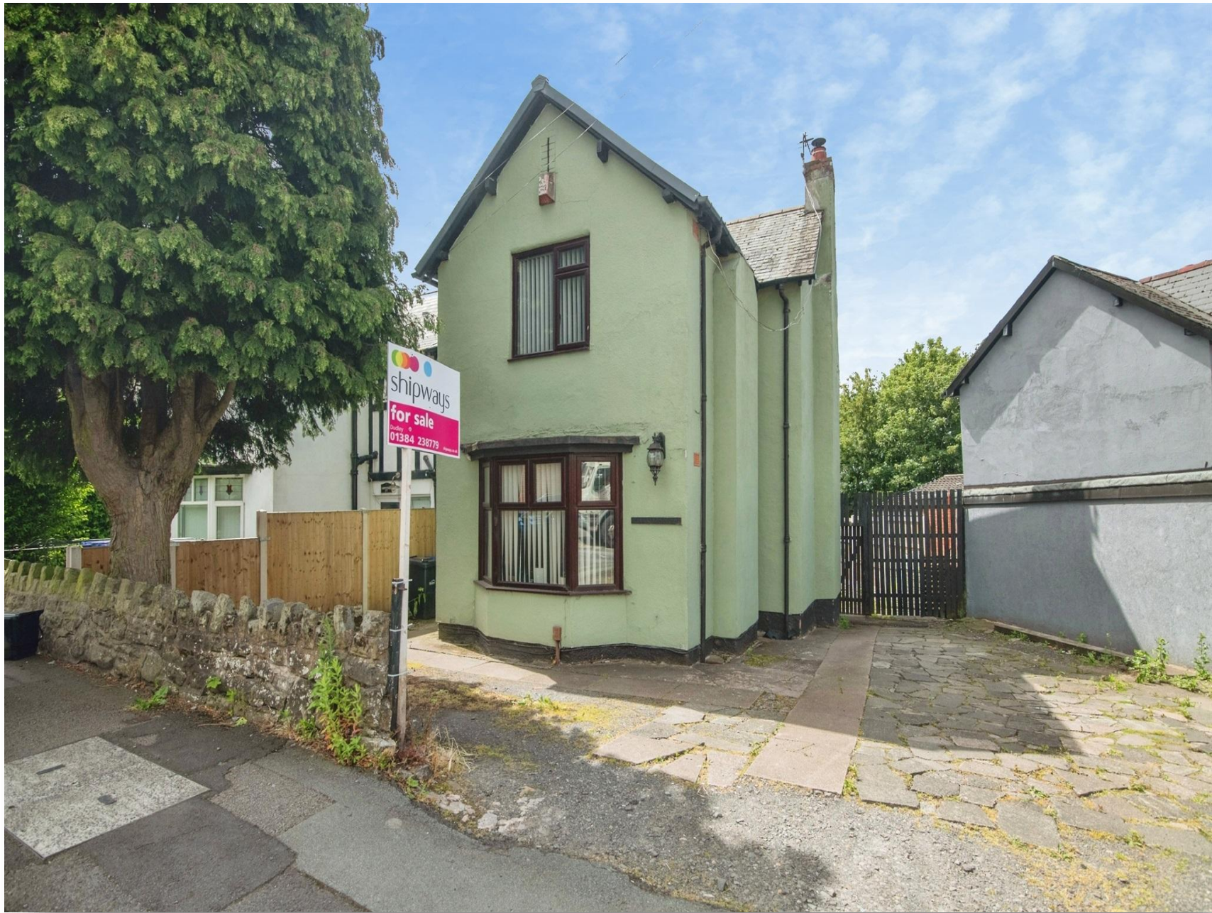
Parkway Road, DUDLEY DY1 2QA