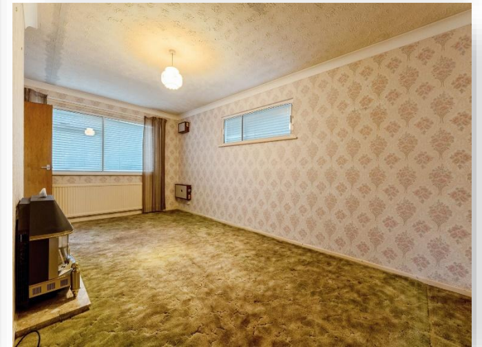
Swallow Drive, Brandon, IP27 0YD