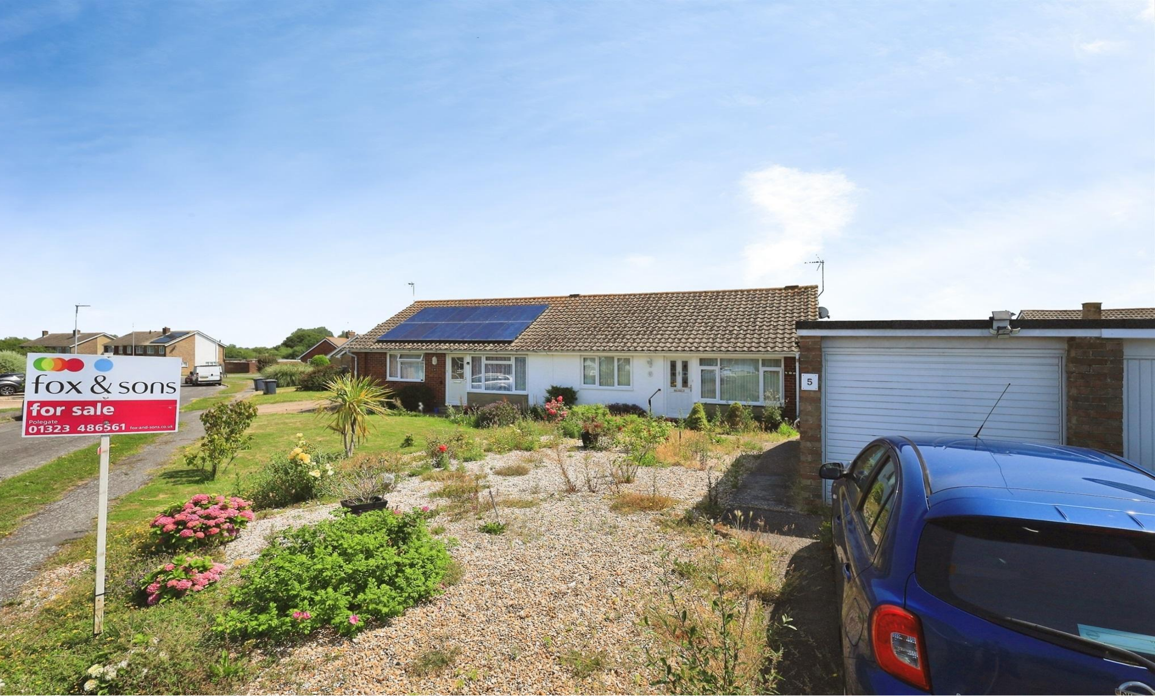
Hawksbridge Close, Eastbourne BN22 0RJ