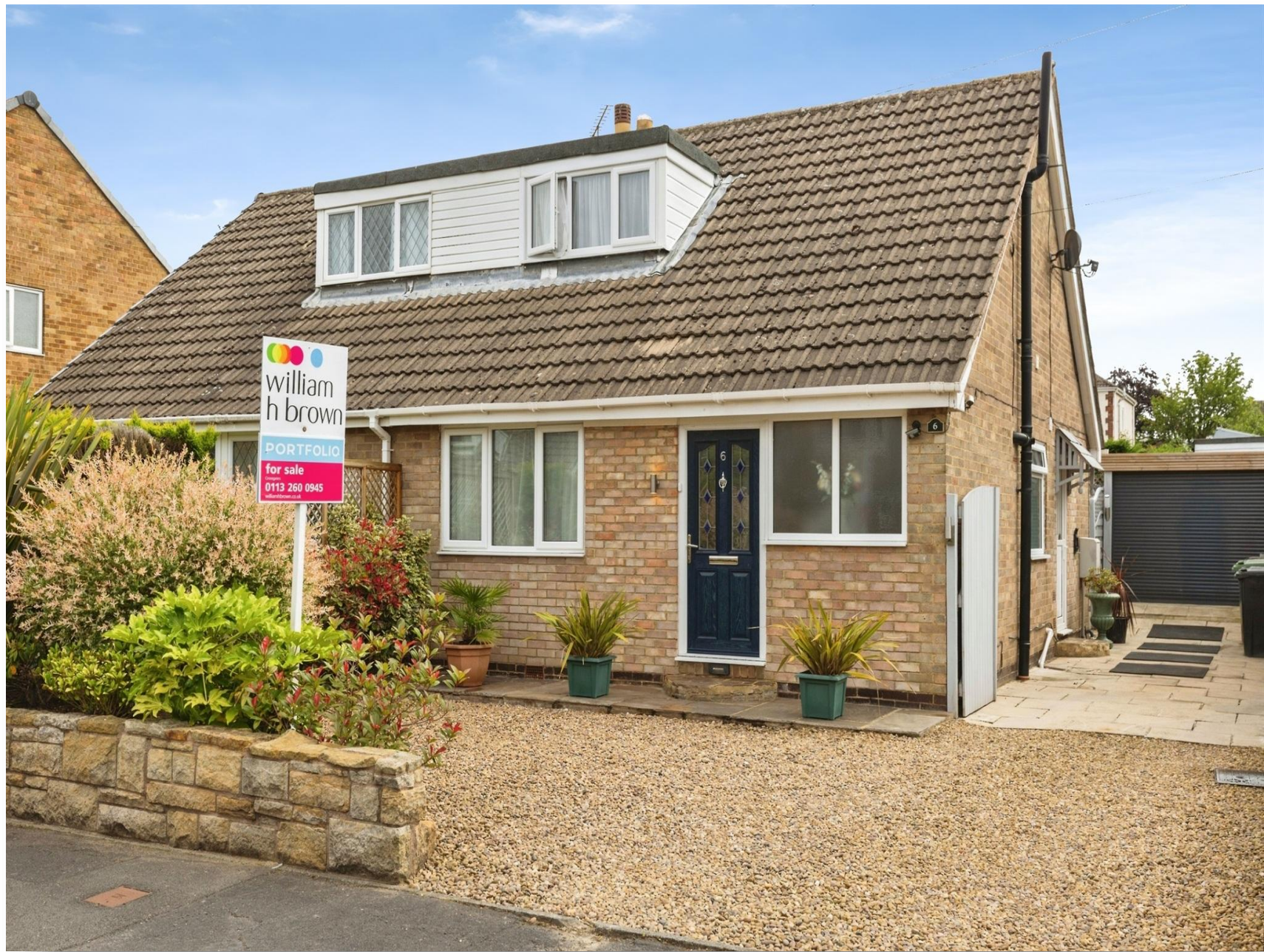
Morwick Grove, Scholes Leeds LS15 4DS