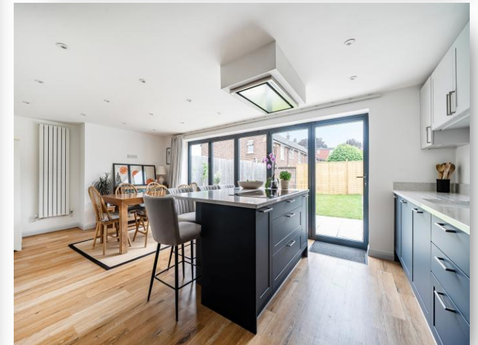
8 Moffy Hill, Maidenhead SL6 7SL