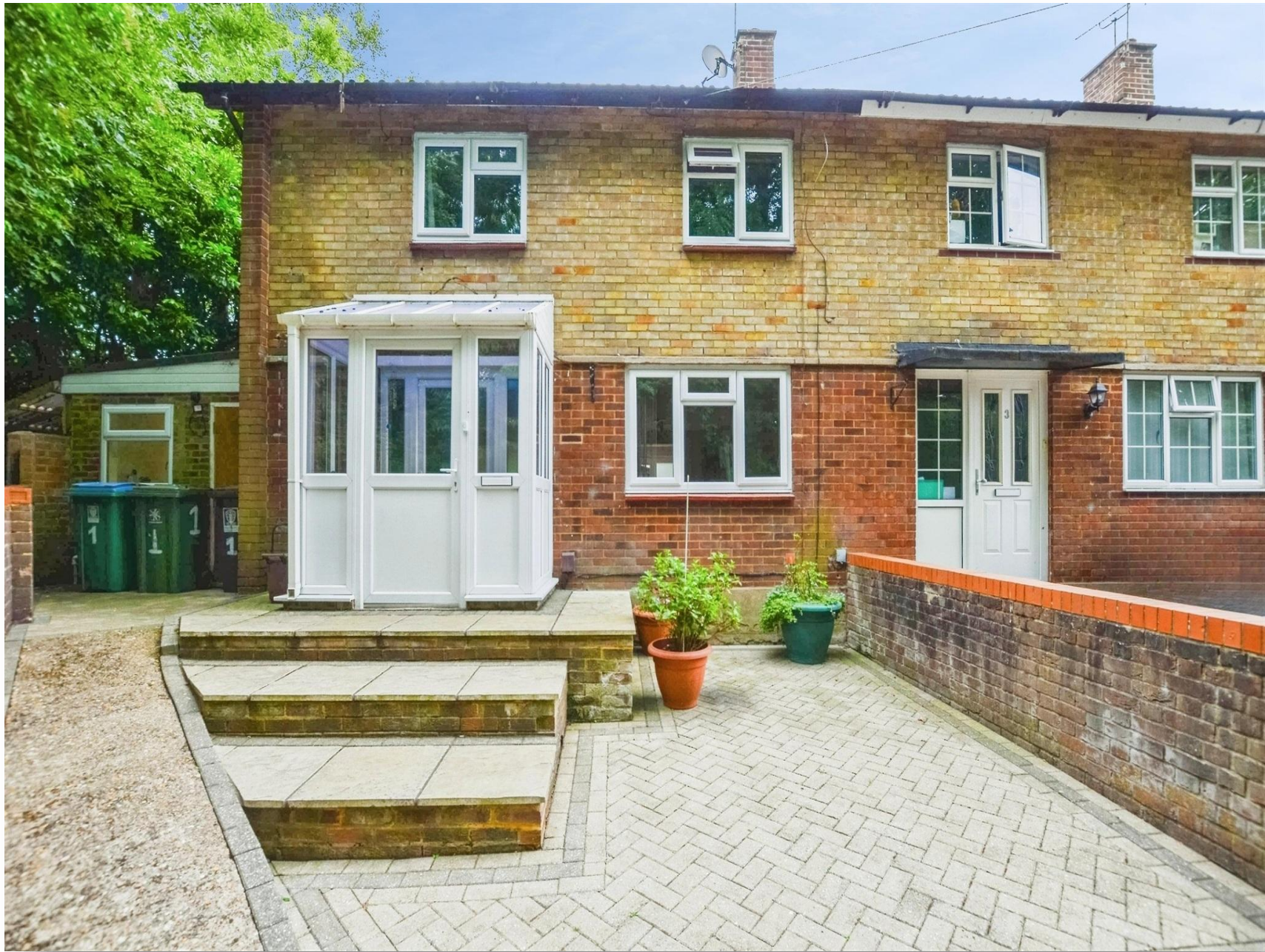
The Gossamers, Watford, WD25 9AW