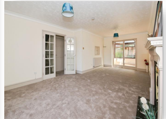
Redbridge, Peterborough PE4 5DR