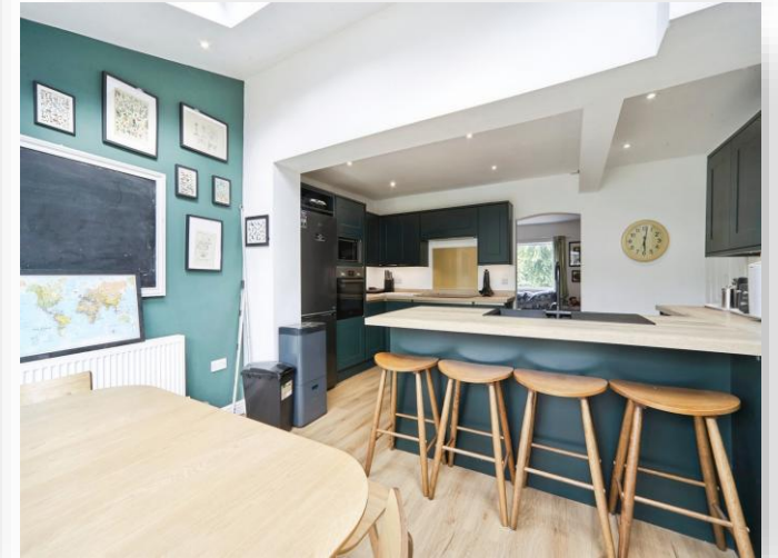
Salmon Crescent, Horsforth Leeds LS18 4ET