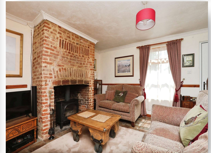
The Retreat High Street, Tittleshall, King's Lynn, PE32 2PJ