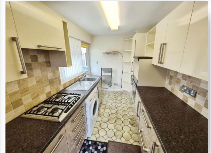
Danefield Road, Wirral, CH49 3PB