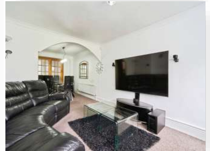
Hough End Lane, Leeds LS13 4EY