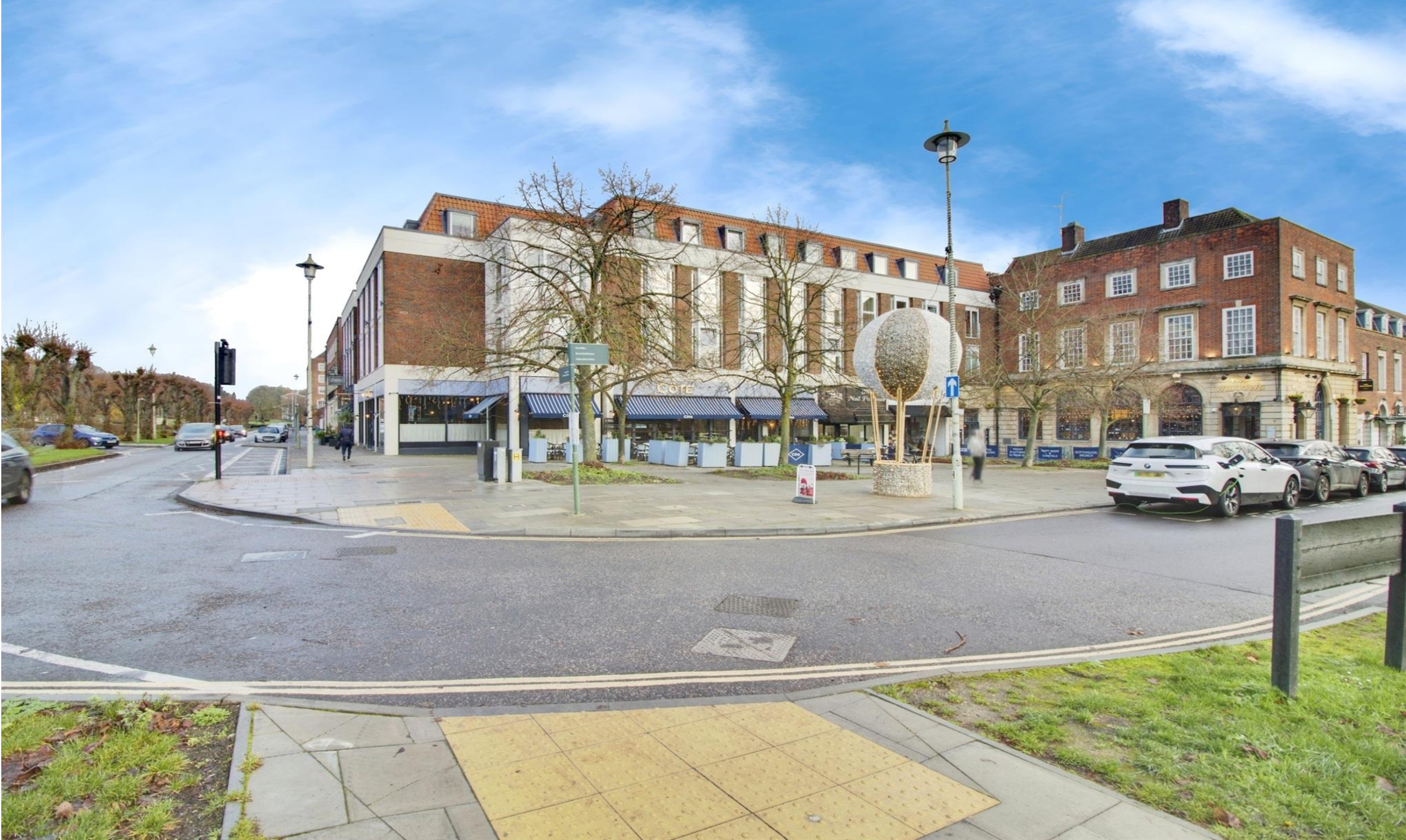
Fountain House Parkway, Welwyn Garden City AL8 6DS