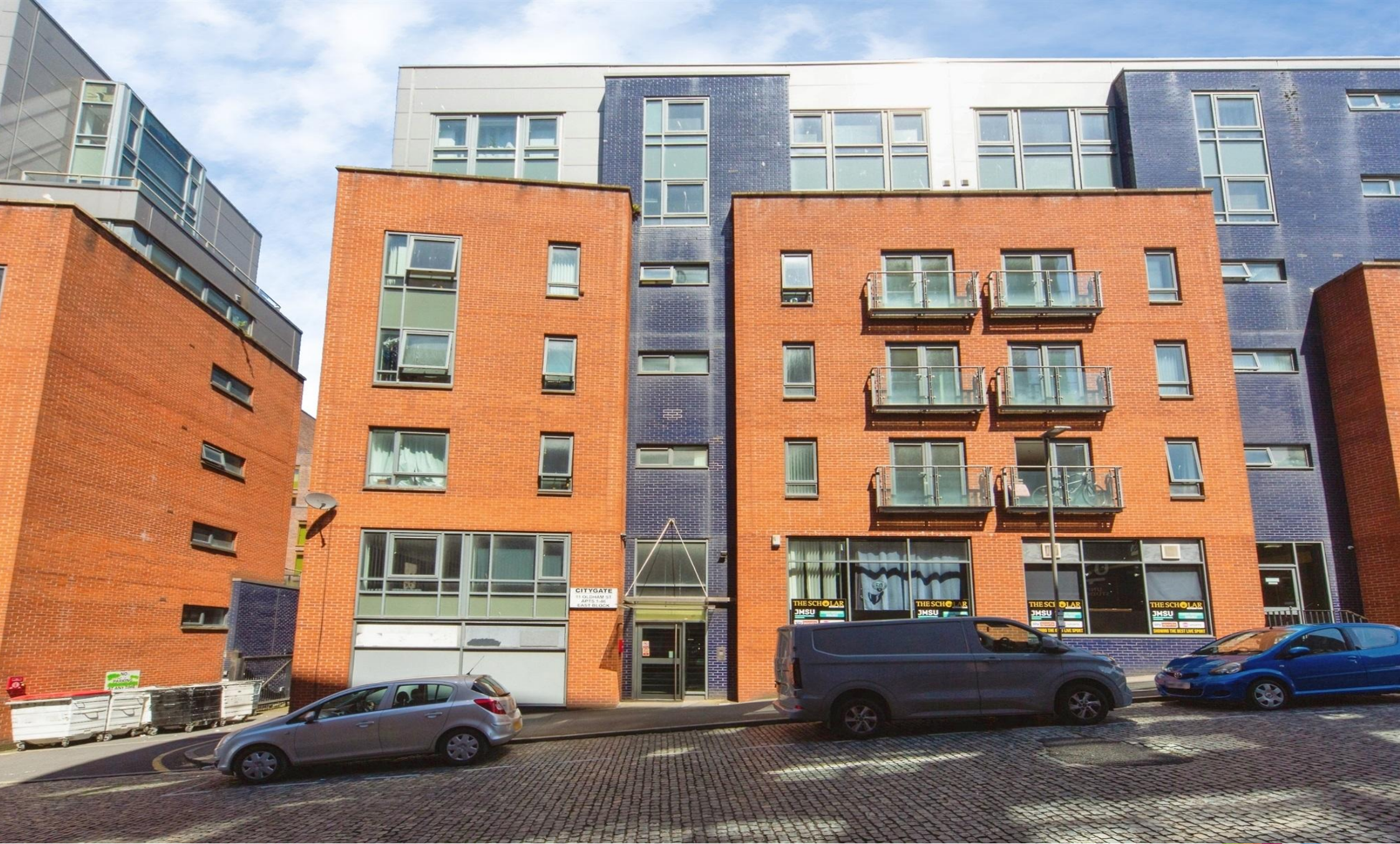
Oldham Street, Liverpool L1 2SU