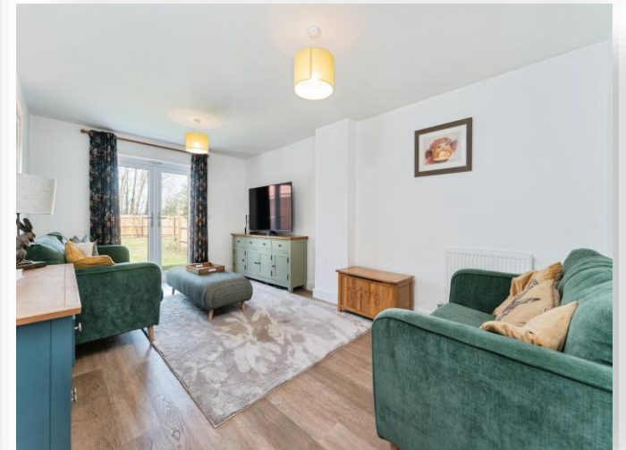
Perch Chase, Soham CB7 6AJ