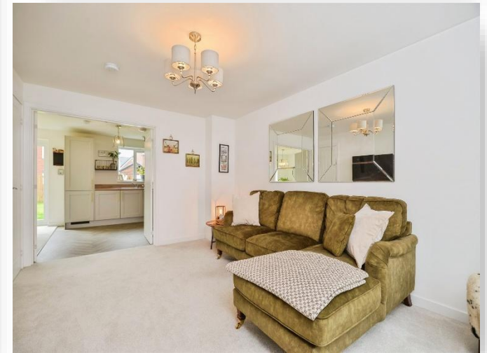
Ribblesdale Way, Stockton-On-Tees TS21 1GA