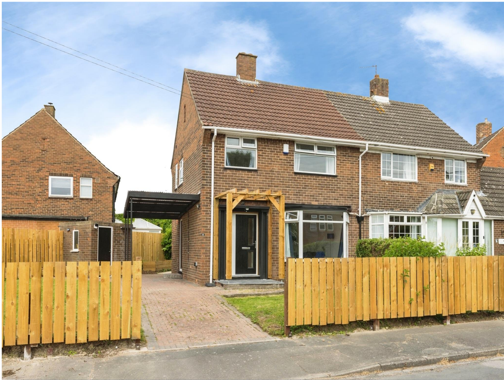
Swardale Green, Leeds LS14 5HJ