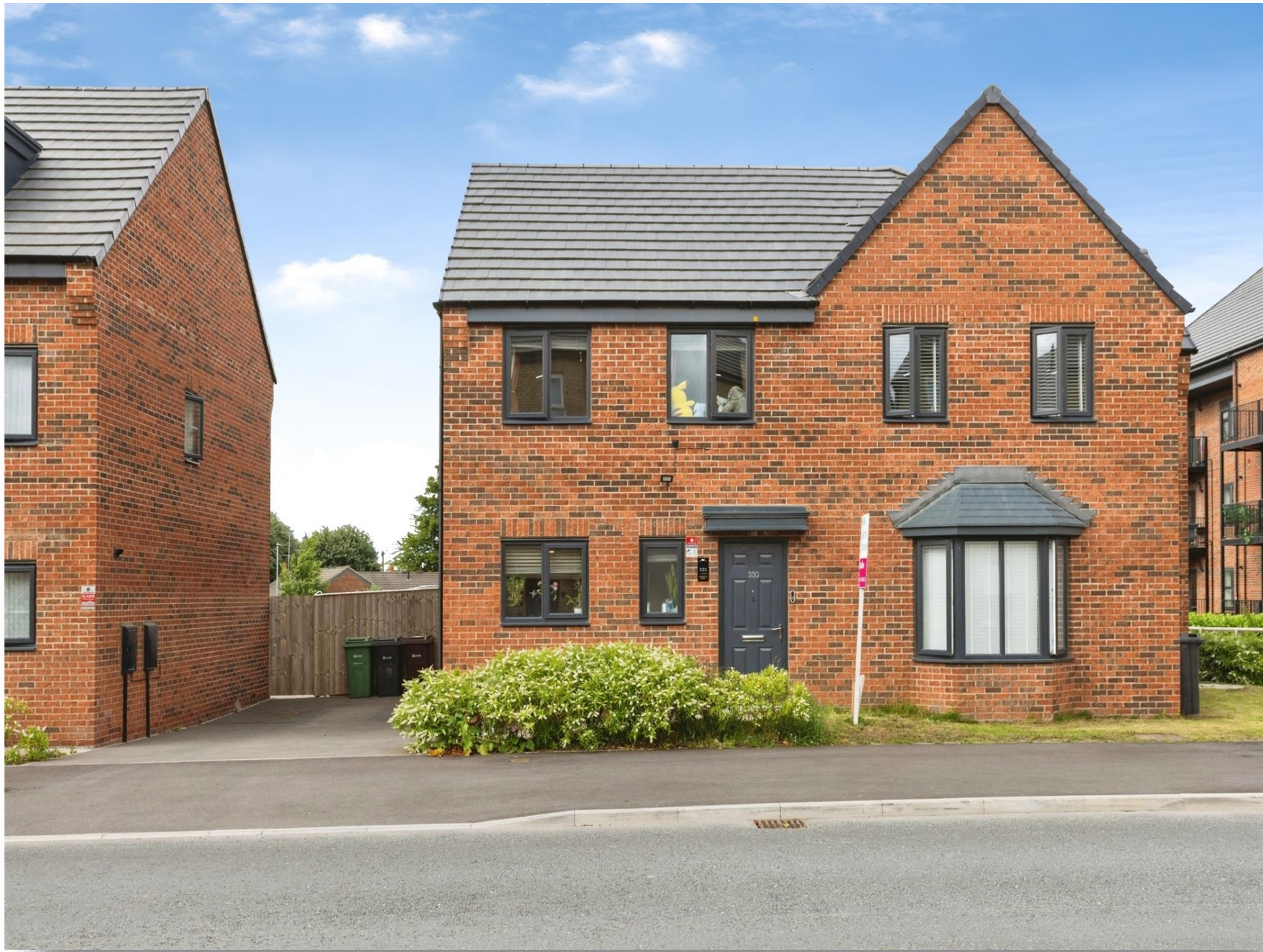
Magnolia Road, Seacroft Leeds LS14 6XT