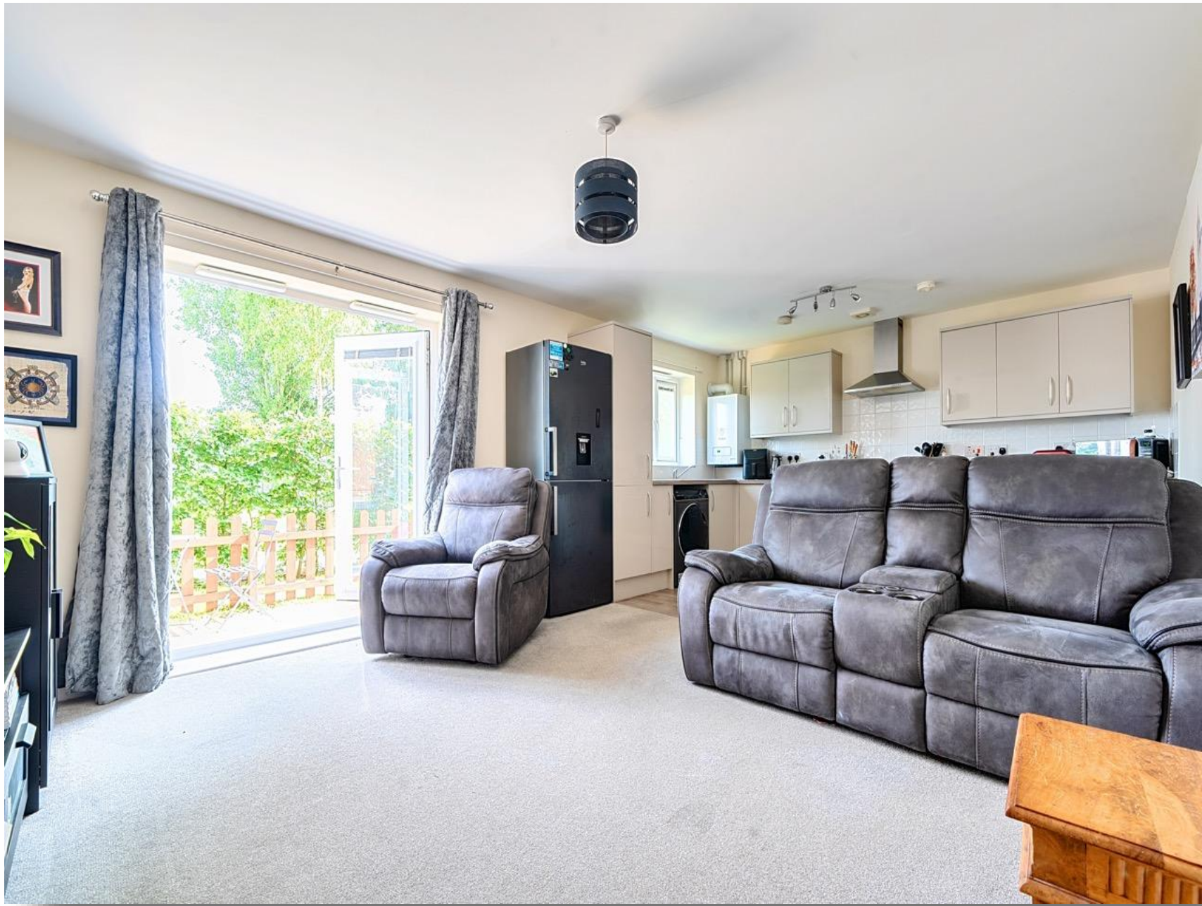
Priors Orchard, Southbourne, Emsworth PO10 8GE